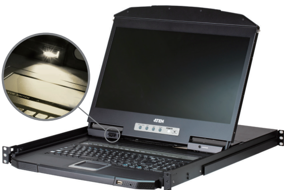
CL3116 Front View