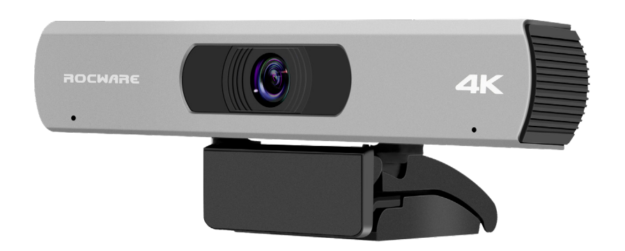
RC17/RC18 is a HD commercial camera designed specifically for small to medium-sized meeting rooms in enterprises. It offers a choice between two lens models: RC17 120° fixed lens or RC18 84° auto-focus lens, depending on the requirements of the meeting room. Both models feature a 4K CMOS sensor that achieves a resolution of 3840x2160, delivering a more detailed and realistic video conferencing experience.