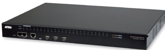
SN0148 Front View