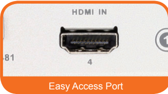
Easy Access Port One HDMI input port on front panel for easy access