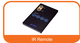
IR Remote Extra-thin IR handset allows easy switching